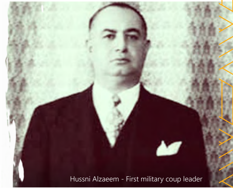
Husni Alzaem - First military coup leader

While the union was popular and publicly demanded by both nations; however, the conversion to the new