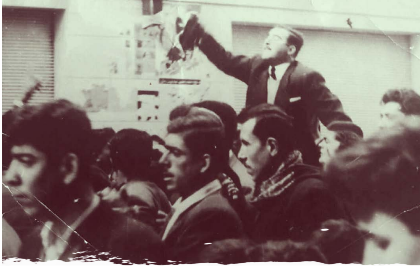
Labor demonstration in the fifties