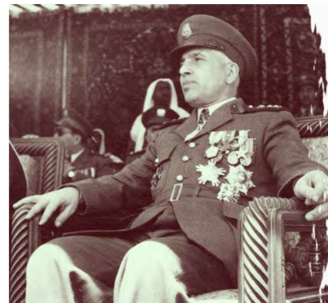
Adib Alshishalkli - Syrian military 1950s

According to Al-Deeb's book, a sum of twenty pamphlets were published only in two weeks of lifting the ban on the party's activities. The publications urged the government for more reforms and enact a large spectrum of liberties in the country. The emergency statue was lifted and after drafting a Party Act, a new parliamentary election was planned in July 1963.