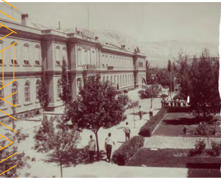
Damascus University end of 1950s

appointing one. In this way, the party ensured that the high level of these bodies is loyal to the ruling party. Associations were transferred to have full Baathist loyal members. For instance, the farmers' union, established in 1964, had rejected any member who is not faithful to the party and worked to replace any member of staff of the association whose loyalty was equivocal.