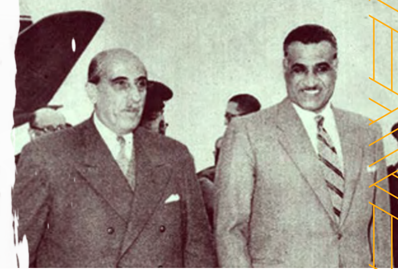
Abdul Nasser & Shukri AlKwatli - United Arab Republic 1958

In contrast, the initiative did result in zero gains and the military interference dominated the state's executive and governmental institutions. In parallel, The Baath party officially controlled Iraq's rule after a bloody coup in the county in February 1963, where the military sector removed the civil authority. However, his intervention did not have the same impact in Syria. Until a new military coup once again by Abdul Kareem Al Nahlawe. He worked to constraints any enterprise that worked to uphold social and civil rights. In fact, he instilled military intervention control in the government and the state's ministries. Eventually, Nahlawe's was overthrown by what became the final Baath coup which led the defense minister Hafez Al-Assad to become the Syrian's presidency on the 8th of March coup.