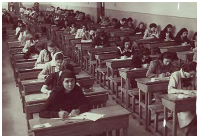
University exams 1950s